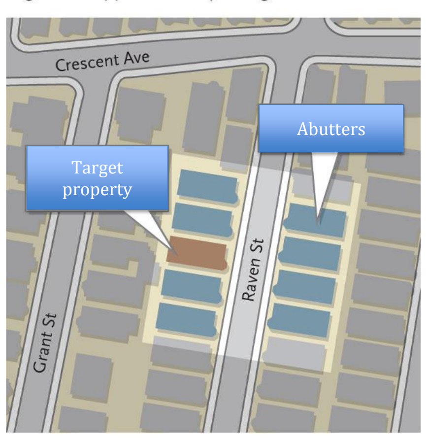
Figure 1: Typical Study Neighborhood

from the abandoned house and all buildings directly across the street from the house. Figure 2 illustrates a typical block and the dwellings considered in our sample. The number of parcels per block ranged from five to nine. In certain instances we expanded these criteria. This occurred if, while visiting the block, we noted that residents of a building outside this immediate area had a clear view of the house and thus would be aware of and potentially affected by the abandoned building. We focused on this limited set of respondents, as we expected the NSP to have the greatest impact on residents living closest to the abandoned buildings. We also excluded residents who abutted the target property from the rear, because in most cases, the rear abutters did not have clear views of the target properties.