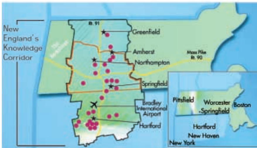
The Knowledge Corridor extends from the Vermont border to just below Hartford. Each red circle represents a college or university.

The partnerships began in 1996 in western Massachusetts when a group of business leaders came together to try to improve the economic climate in Hampden and Hampshire counties. The area had lagged significantly behind the state average in job creation and other economic indicators, and the cities and towns in the area competed against each other for any business