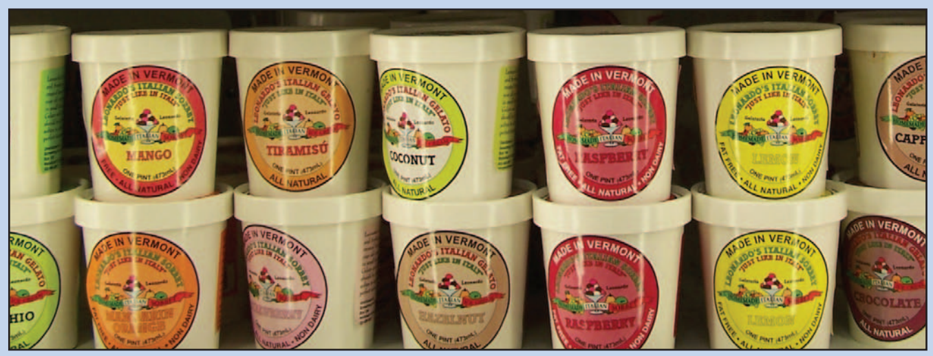
Sorbet, made in Vermont, displayed on a grocery store shelf.