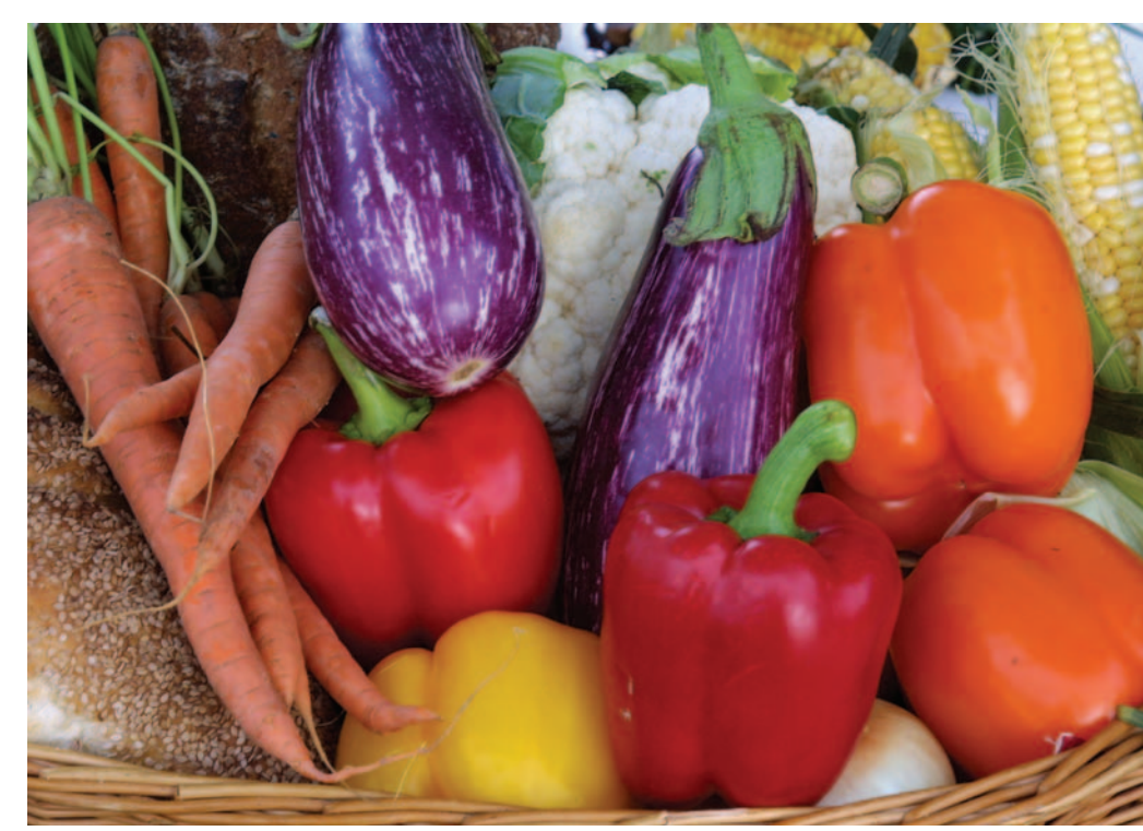
Home grown produce in East Burke, Vermont.

Despite the state's natural strengths in agritourism, the industry is not a panacea for saving Vermont's farms. Like starting any small business, the costs of entry are high. Initial investments in planning, infrastructure, and marketing may be substantial, especially for those farms interested in larger agritourism enterprises such as bed and breakfasts. Additionally, expensive liability and business insurance must be purchased, and a range of regulatory issues must be addressed, covering everything from public health and safety to zoning, licensing, and taxes. Moreover, the risks of an