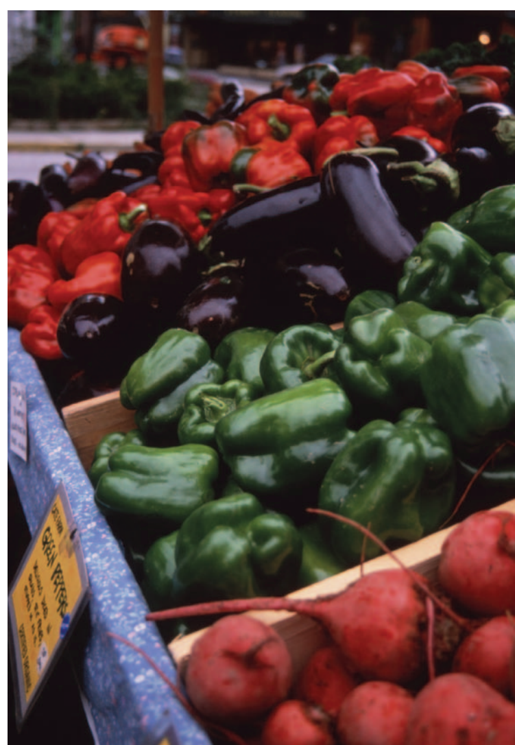
Vermont produce for sale at a farmstand. Photograph by Kindra Klineff, courtesy of Vermont Department of Tourism and Marketing.

ly in remote areas, and the value of the easement is overstated. Sometimes, landowners are paid for conservation easements with little to no value-easements on land that would have remained preserved without them, such as a flood plain, steep hillside, or property subject to restrictive zoning regulations. Occasionally, profits are made from easements that actually increase the value of the land, with real estate agents advertising them as an asset. While the majority of conservation easements are valued appropriately, abuses are common and costly enough that the IRS has issued a public notice threatening fines, excise taxes, and even loss of nonprofit status for landowners