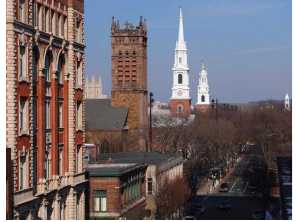
Downtown New Haven, Connecticut.

Some aspects of small cities need attention and support before many suburbanites tap those amenities. Fortunately, momentum is building among policymakers, advocates, and researchers for new actions to strengthen these cities and all who choose to live in them.