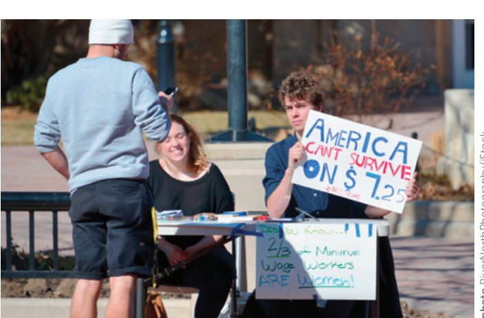
Activists raise awareness of the plight of low-wage workers.

Thirty states and Washington, DC, have adopted the expanded Medicaid provision. That includes all the New England states except Maine. In addition, enrollment in traditional Medicaid—