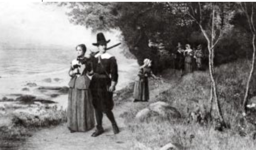
The family was the center of the Puritan social system and the primary means by which its values were transmitted.