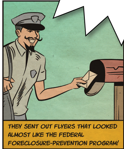
THEY SENT OUT FLYERS THAT LOOKED ALMOST LIKE THE FEDERAL FORECLOSURE-PREVENTION PROGRAM!