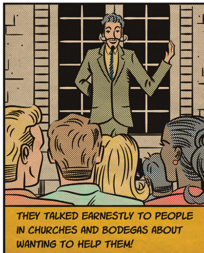
THEY TALKED EARNESTLY TO PEOPLE IN CHURCHES AND BODEGAS ABOUT WANTING TO HELP THEM!