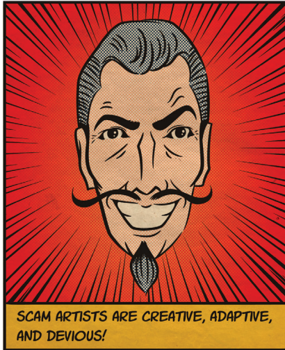
SCAM ARTISTS ARE CREATIVE, ADAPTIVE, AND DEVIOS!

More info http://www.consumer.ftc.gov/articles/0193-facing-foreclosure