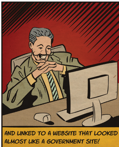
AND LINKED TO A WEBSITE THAT LOOKED ALMOST LIKE A GOVERNMENT SITE!