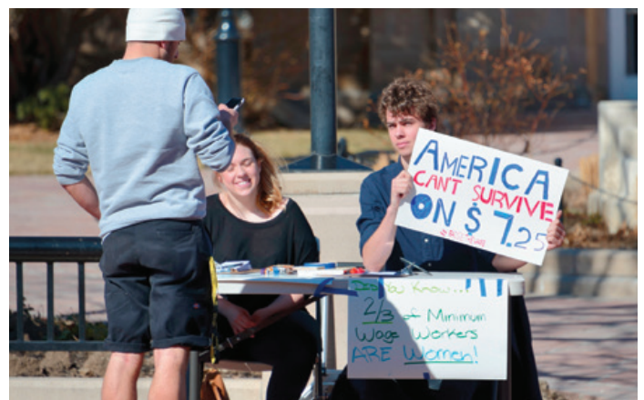
Activists raise awareness of the plight of low-wage workers.

Thirty states and Washington, DC, have adopted the expanded Medicaid provision. That includes all the New England states except Maine. In addition, enrollment in traditional Medicaid—