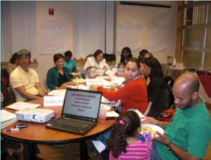
2010 Design Team