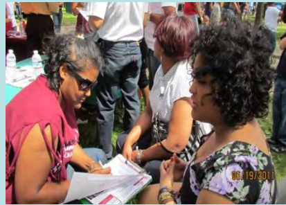
2011 500 Conversations