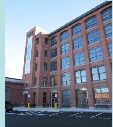
2012 Financial Stability Center