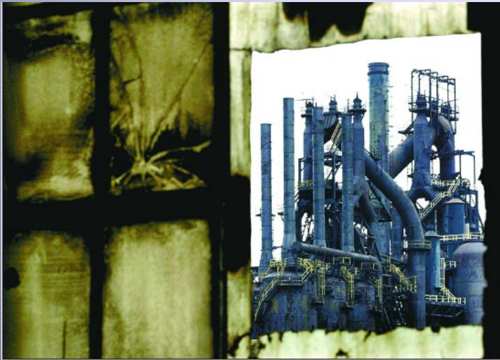
Part of the idle Bethlehem Steel is seen through the cracked glass of another building. Casino operator Las Vegas Sands Corp. won a slot-machine license Wednesday for a casino at the site.