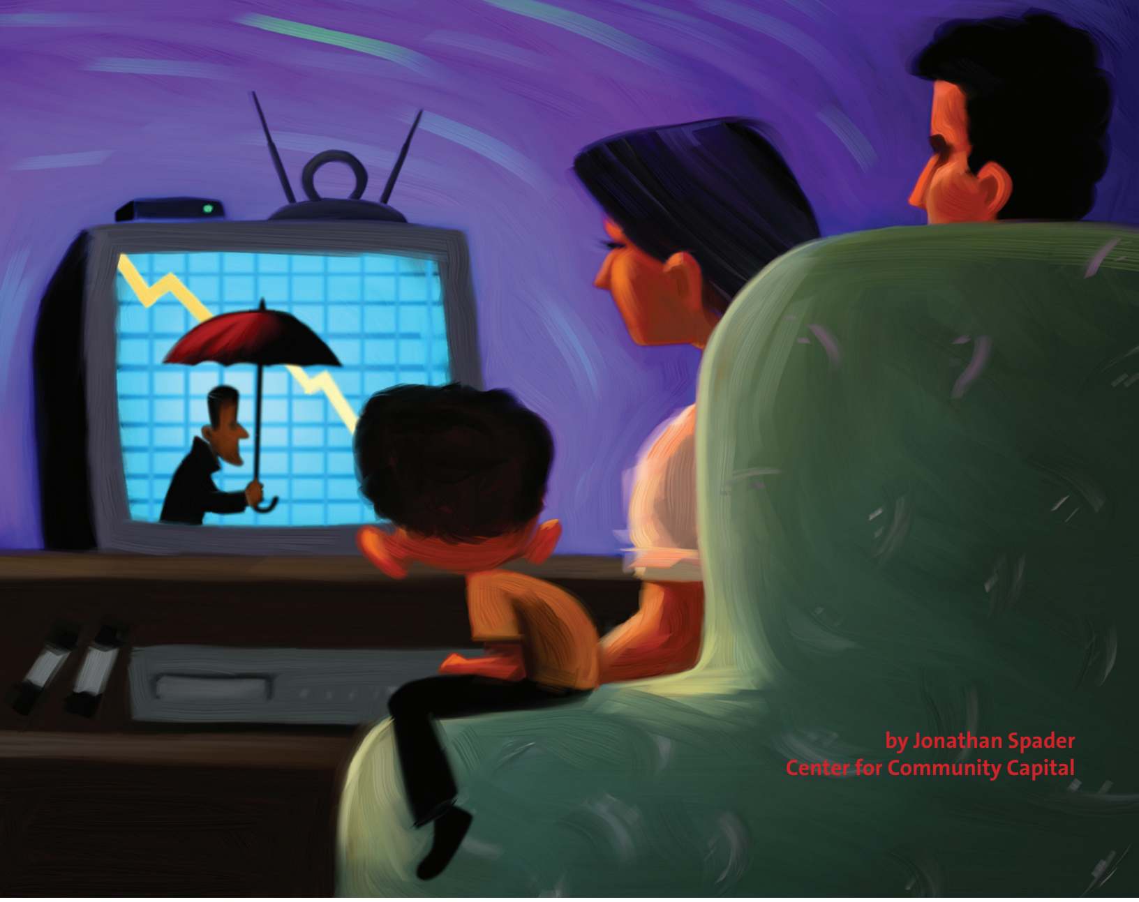
Illustration: Kirk Lyttle