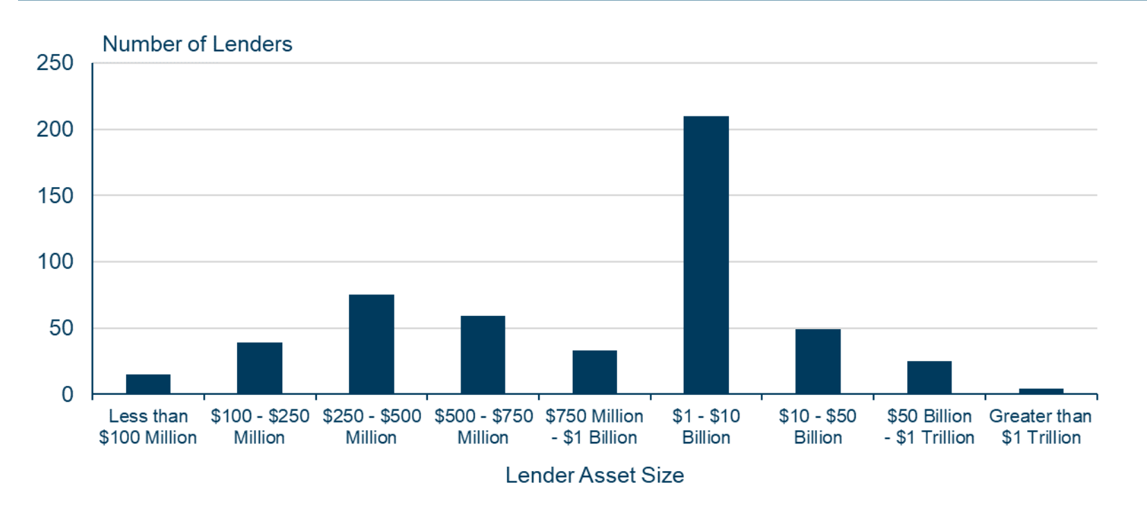
Figure 1: Asset Size Distribution of MSLP Registered Lenders

Note: Registered lenders totaled 509 as of August 4, 2020.